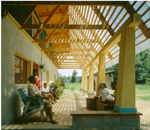
Bryant "Hay Bale" House, 1994 Hale County, Alabama